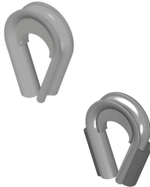
Also available with retaining bands on request