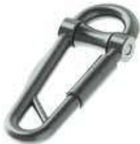
Pear Ring Type

with reel and cartridge 1 1/4" and 1 3/8"