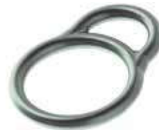
Ring type Stirrup