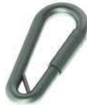
Pear Ring type

with reel and cartridge 1 1/4" and 1 3/8"